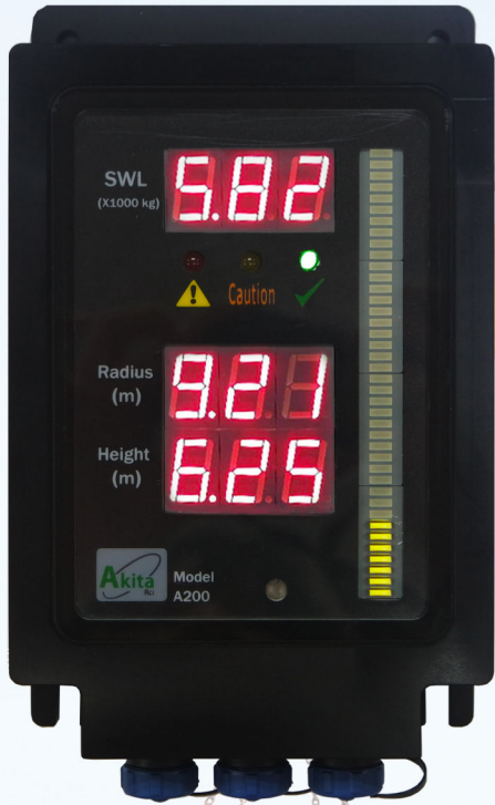
RATED CAPACITY INDICATOR