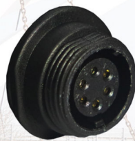
Improved Dust Cap